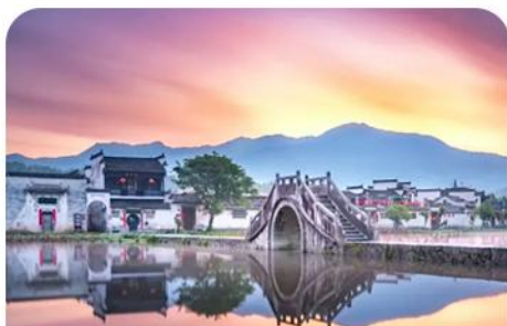
黟县【宏村】 Yi Xian Hongcun