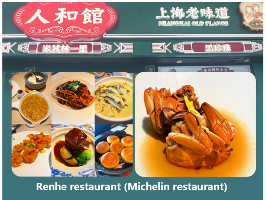
Renhe restaurant (Michelin restaurant)