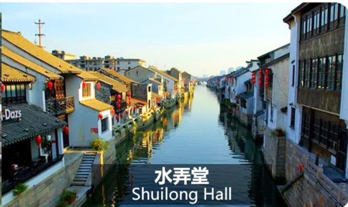
水弄堂 Shuilong Hall