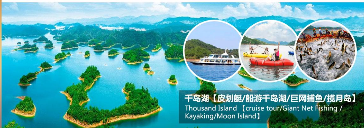
千岛湖【皮划艇/船游千岛湖/巨网捕鱼/揽月岛】 Thousand Island 【cruise tour/Giant Net Fishing / Kayaking/Moon Island】