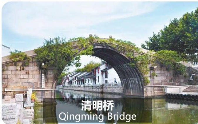
清明桥 Qingming Bridge