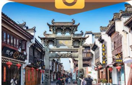
屯溪老街 Tunxi Old Street